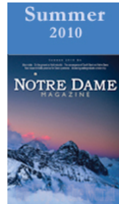
Notre Dame Magazine “From Mountain Top to Global Health” Summer 2010