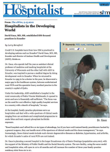
The Hospitalist “Hospitalists in the Developing World” E-News Wire Sept 2010