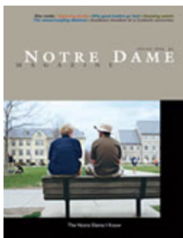
Notre Dame Magazine “The Road to Pedro Vicente Maldonado” Summer 1999, Volume 28, Number 2