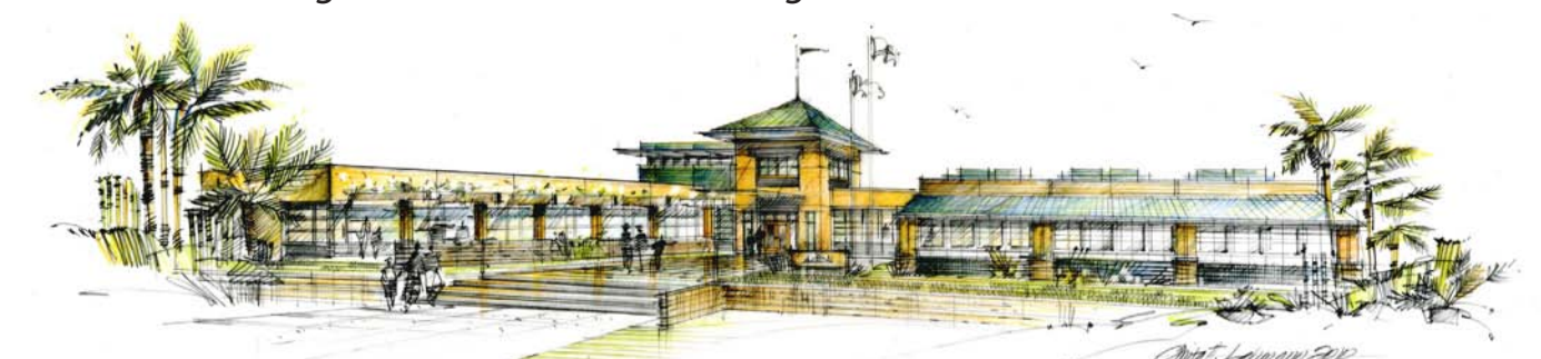
AHD is planning the building of a second, larger teaching hospital and research center in Santo Domingo